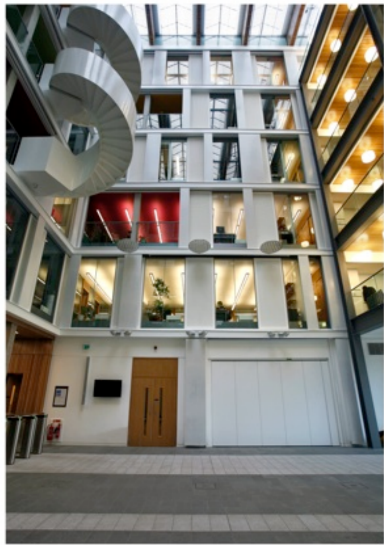
School of Informatics